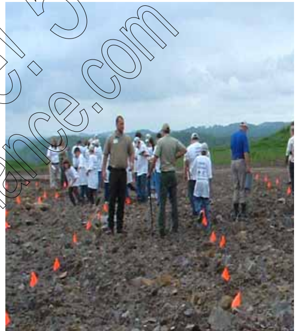
Orange flags mark planting rows for students to follow as they plant chestnuts and oaks on reclaimed land.