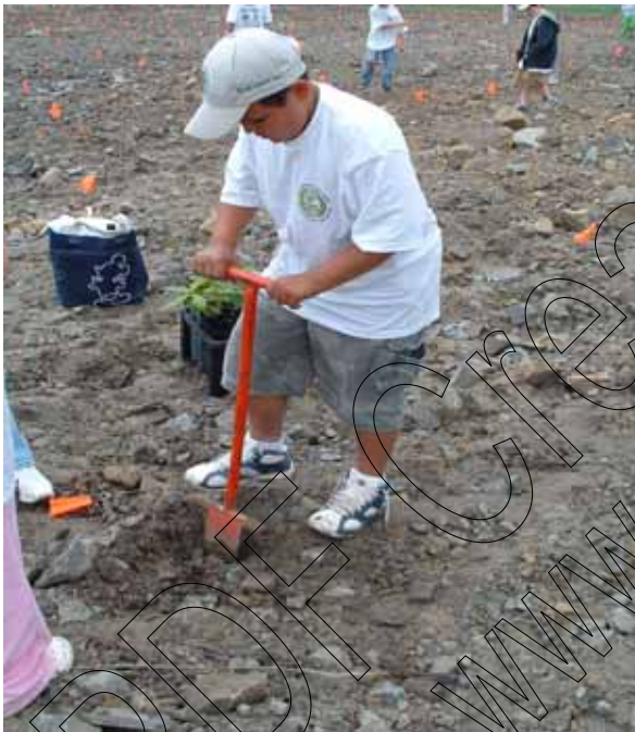
Students used dibble bars to prepare holes for American chestnut seedlings atop strip mine land in Perry County

ARRI is working to improve forest reclamation success in Kentucky, Maryland, Ohio, Pennsylvania, Tennessee, Virginia, and West Virginia. A comparison of tree growth among compacted mine sites, non-compacted mine sites, and undisturbed forest sites revealed that trees grew larger and faster on non-compacted mine sites. Forest reclamation on surface mines is possible if the FRA is followed. Additional information about ARRI and FRA can be found at http://arri.osmre.gov/Default.htm