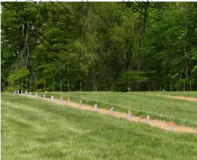
Oldham County Orchard Meades Landing