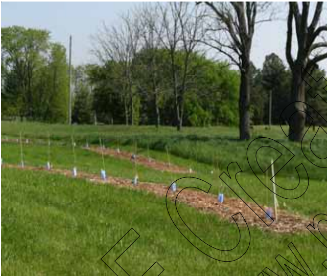
Shelby County Orchard Near Shelbyville